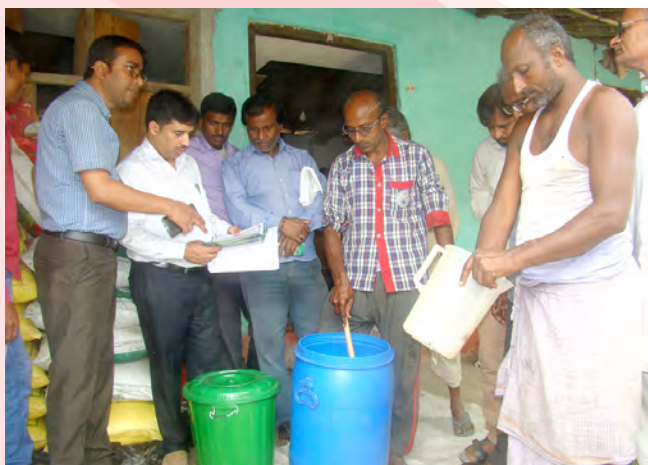
NRCL scientists demonstrating preparation of organic inputs and interacting with farmers

eliminates the dependence of farmers on commercial inputs like fertilizers and pesticides. These measures use the ecological engineering principles which encourage beneficial microbes and pest predators to take care of crop health and productivity. Ethnomedicinal plants such as neem ( Azadiracta indica ), catnip or catmint ( Nepeta cataria ), karanj ( Pongamia pinnata ), goma or thumba ( Lucas aspera ), aak ( Calotropis procera ), datura ( Datura stramonium ), garlic ( Allium cepa ) etc. were extracted in cow urine was advocated as natural pesticides and preparation and application method was demonstrated. A practical demonstration of application of NRCL Trichoderma in litchi and vegetables were also