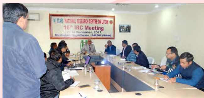
16 th IRC meeting in progress

During the year, 16 th Institute Research Council (IRC) meetings were held on 11-16 th December, 2017 under the chairmanship of Director, ICAR-NRCL. During the meetings, progress report of research projects along with technical programmes was discussed in detail. The new research projects were also discussed and finalized.