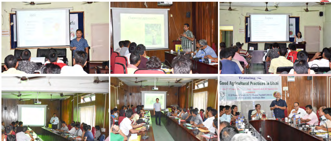
Glimpses of training programme on GAP in Litchi from 3-5 th August 2017 at ICAR RC NEH Region, Nagaland Centre, Medziphema