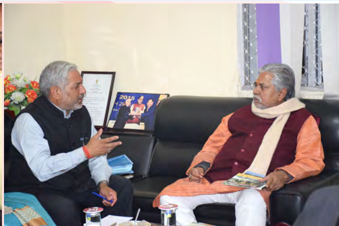
Visit of Dr. Prem Kumar, Minister of Agriculture Govt. of Bihar