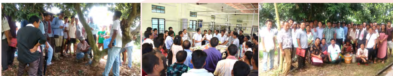
Practical sessions during training programme on GAP in Litchi from 3-5 th August 2017 at ICAR RC NEH Region, Nagaland Centre, Medziphema