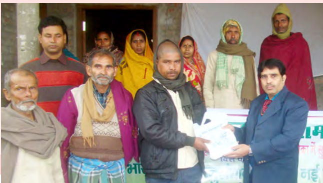
Distribution of NRCL Trichoderma under Farmers' FIRST Project