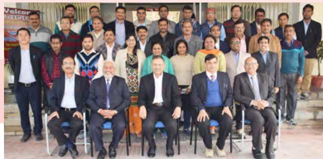
Participants of the winter school with the scientific staff of NRCL and invited speakers