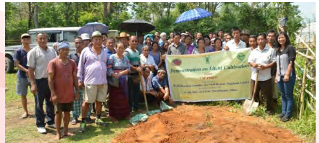
Demonstration programme on litchi cultivation an Ngwalwa village, Peren, Nagaland