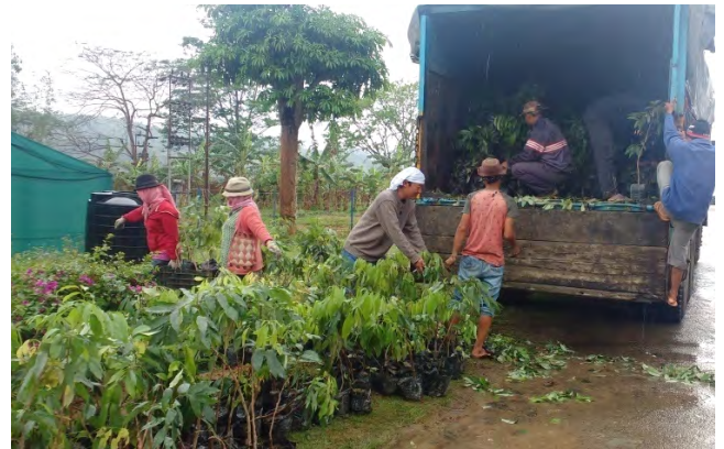
Planting material of litchi provided by ICAR-NRCL after arrival in Nagaland

Air-layers of litchi cultivars Shahi, China, Kasba and Mandraji (25 each) were provided for studying the survival in nursery and subsequent establishment of litchi block at Research farm, Division of Horticulture, ICAR RC NEH Region, Barapani, Meghalaya.