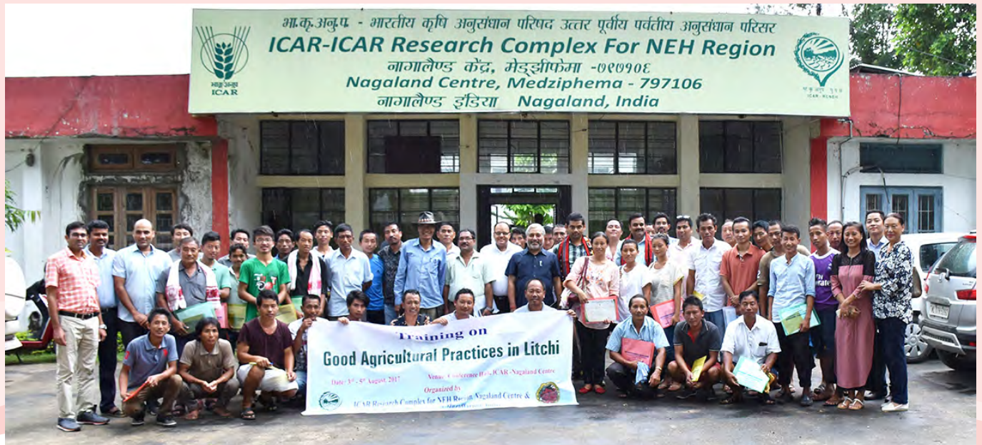
Training programme on GAP in Litchi from 3-5 th August 2017 at ICAR RC NEH Region, Nagaland Centre, Medziphema, India