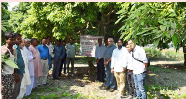
Field day on best management practices in litchi at Bakhari, Muzaffarpur

Another field day cum kisan gosthi on best management practices in litchi was organized at Bakhari, Muzaffarpur, Bihar on 3rd November, 2017. About 25 litchi growers of the village attended the programme. The participants were taught on modern canopy management practices to facilitate utilization of vacant space within litchi orchard through cultivation of locally popular intercrops like turmeric and