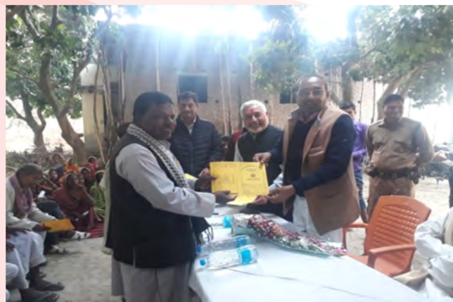
Distribution of Soil Health Card at Damodarpur, Mehshi, E-champaran

World Soil Day was celebrated on 5 December 2017 at farmer's field in village Damodarpur, East Champaran Bihar. On this occasion, Hon'ble MLA Sh. Shyambabu Prasad Yadav was invited as chief guest and various activities were carried out. Soil Health Card was distributed to fifty farmers from the villagers of Ujhilpur and Damodarpur of East Champaran district of Bihar. At the outset, the Director welcomed the guests and highlighted the critical importance of soil and its crucial role in agriculture. The gathering was appraised the importance of soil sampling and management for quality and assured litchi production. The initiative of providing Soil Health Card undertaken by NRCL was highlighted which is bedrock towards achieving the target of doubling farmers' income. Various aspects towards production management, integrated disease and pest management of litchi was elaborated to the public.